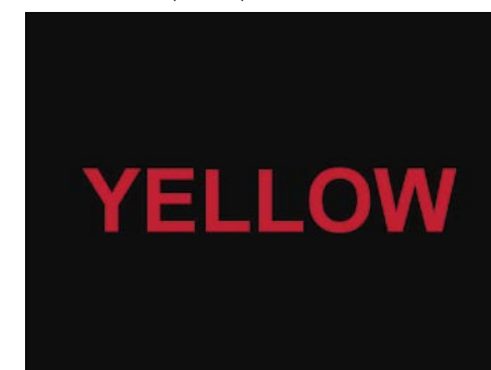
Example: Stroop Interference Test

A TTL level trigger can be used to record up to 255 discreet event markers allowing you to use the Neuroscan STIM 2 or other stimulus generation tools for eliciting ERPs. The NuAmps supports either individual electrodes through Touch-Proof connectors, or the QuikCap, via a high density connector.